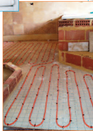
Typical in-screed installation

The in-screed system is ideal for installation in bathrooms (within the final screed before tiling). It is extremely cost effective and offers the ultimate luxury at a very affordable price. The system can also be installed over larger areas in any room where a minimum of 20mm screed is being applied.